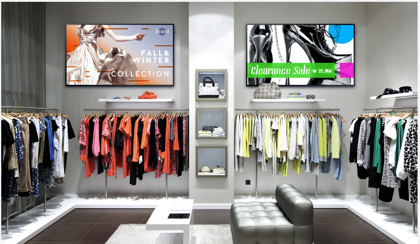
Figure 1. Samsung DHE Series SMART Signage delivers immersive and luxurious shopping experience

DHE Series displays' 24/7 robust durability delivers uninterrupted and dependable operation for consistently compelling customer messaging. Luxury retailers, malls and entertainment venues that run 24 hours a day and must provide rich messaging stand to gain the most from these continuously running displays that deliver reliable messaging while lowering costs due to less downtime and equipment maintenance.