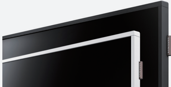
Figure 4. Various bezel types for polished professional look

This function keeps the displays functioning when issues arise by automatically switching to alternate active sources when the currently active sources go offline.