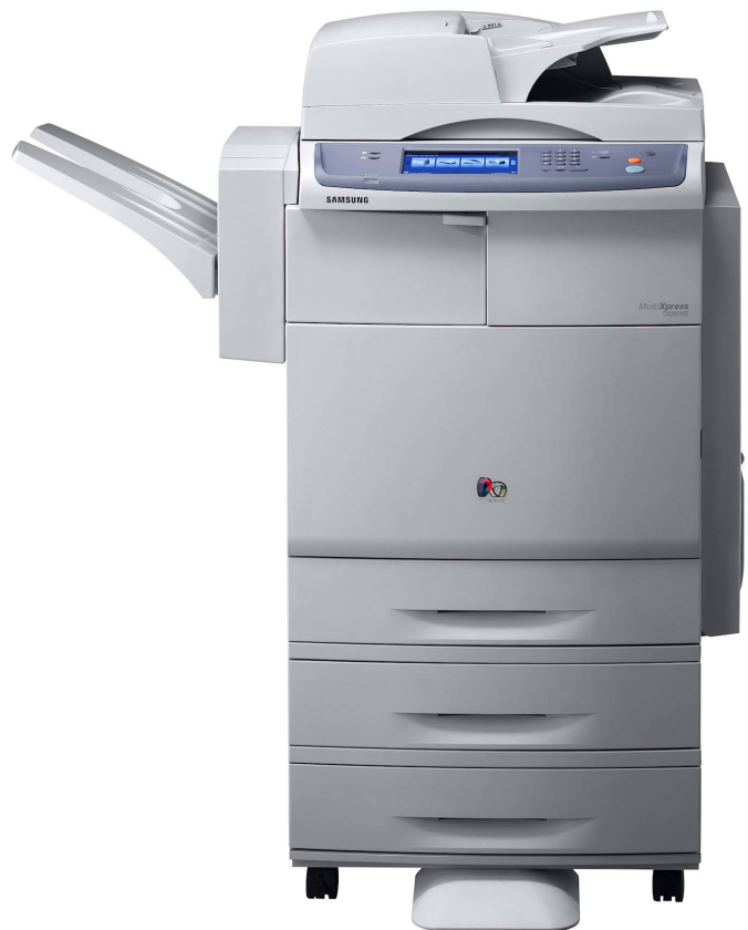
Samsung MultiXpress C8380ND

Samsung Electronics Co., Ltd. is a global leader in semiconductor, telecommunication, digital media and digital convergence technologies with 2007 consolidated sales of $103.4 billion. Employing approximately 150,000 people in 134 offices in 62 countries, the company consists of five main business units: Digital Media Business, LCD Business, Semiconductor Business, Telecommunication Business and Digital Appliance Business. Recognized as one of the fastest growing global brands, Samsung Electronics is a leading producer of digital TVs, memory chips, mobile phones and TFT-LCDs. For more information, please visit www.samsung.com .